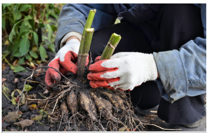
Digging the tubers in the fall protects them from winter freezes.