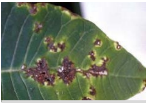
Figure 1: Leaf spot symptoms caused by scab.

Assess bracts (colorful, flower-like structures) and leaves for spots and damage. These spots can be the start of diseases, such as scab and Botrytis blight. Both of these diseases can cause tan to gray-brown spots on bracts and leaves (Figure 1) and ultimately result in plant dieback and defoliation.