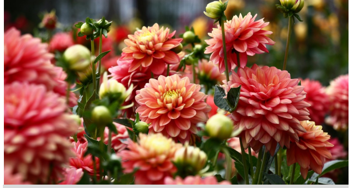
Dahlias are an amazing addition to the garden, but they can be quite pricey.