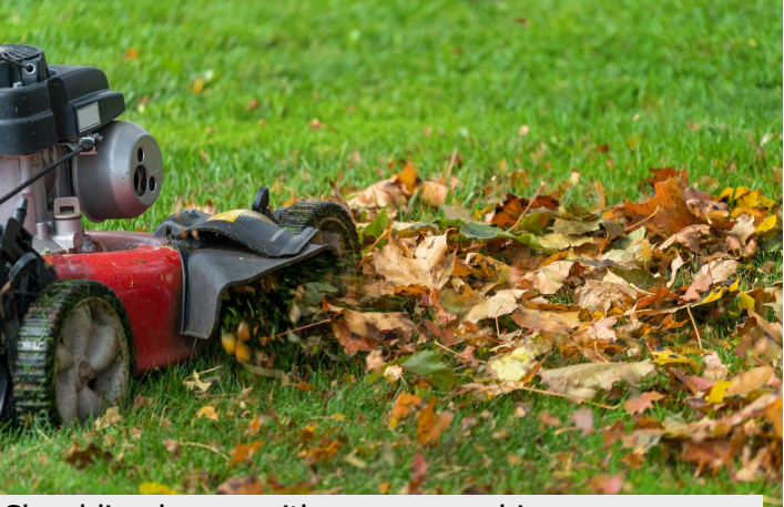
Shredding leaves with a mower, chipper, or shredder helps the leaves break down into a usable compost by next spring. Leaves can still be used as a mulch next spring if not broken into small pieces.

The composting process can be completed in one to two months if materials are shredded, turned to provide good aeration, kept moist and supplied with nitrogen and other materials that cater to compost-promoting microorganisms. Otherwise, it may require 12 months. Periodically turn the compost pile once a month or when the center of the pile is noticeably hot. The more often you aerate, the more quickly you will have useable compost. Compost is useable when it fails to heat up after turning.