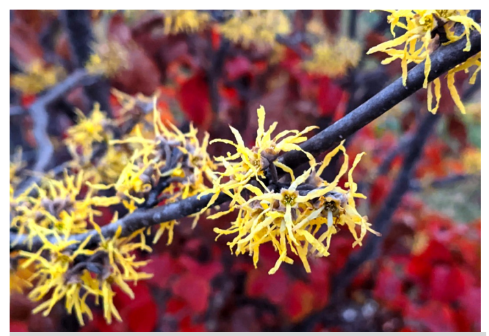
The Common Witchhazel ( Hamamelis virginiana ) is one of the last shrubs to flower in Kentucky. The spidery, yellow flowers are fragrant

summer and have a unique means of mechanical distribution. In other words, when they are ripe, the seed capsules explode apart with a cracking pop and catapult seeds up to ten yards from the shrub.